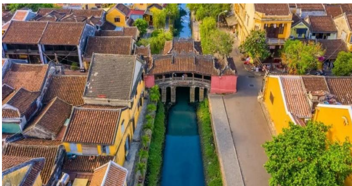
Japanese Covered Bridge