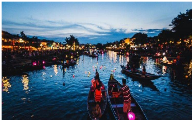
Hoi An at night