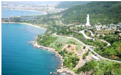
Son Tra Peninsula