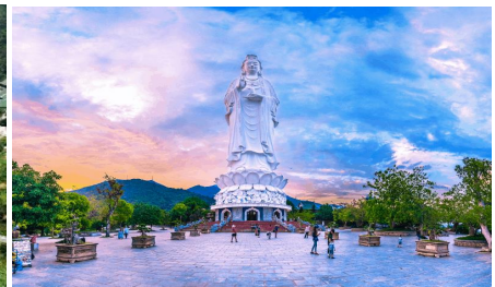
Linh Ung pagoda