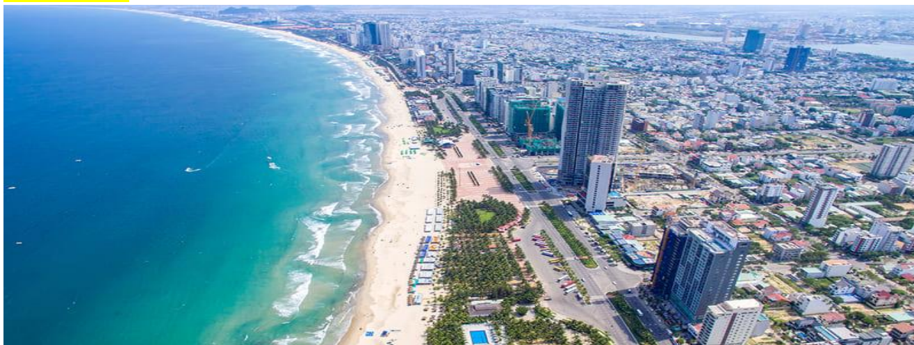
My Khe Beach - Danang