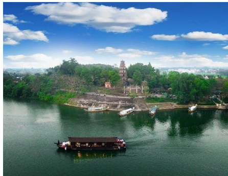
Thien Mu Pagoda